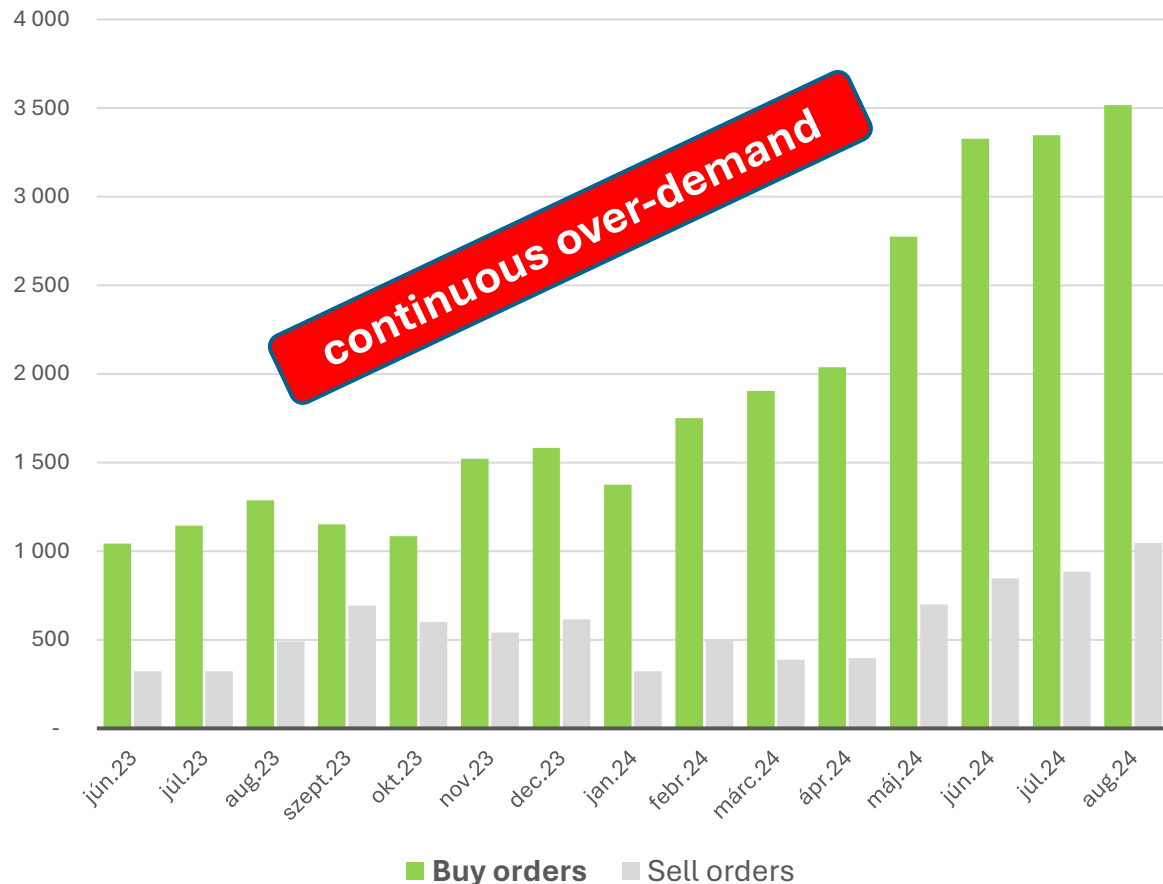
Sell orders and Demand orders on HUPX GO market 2023 Q3 - 2024Q3