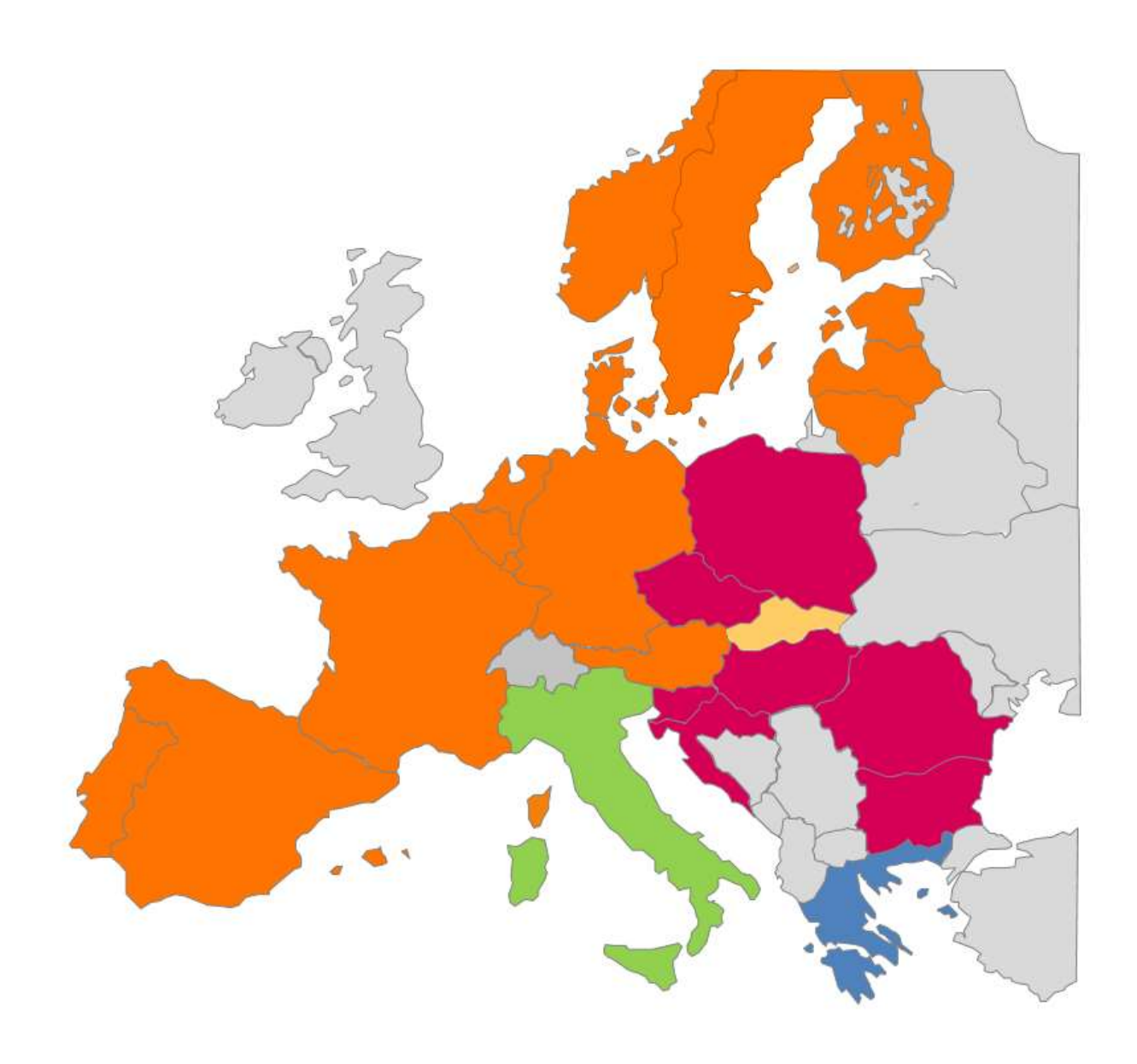
Picture 2: Countries coupled by SIDC solution in 1<sup>st</sup> Wave Go-Live, shown in orange (13<sup>th</sup> June 2018), in 2<sup>nd</sup> Wave, shown in purple (19th November 2019), in 3<sup>rd</sup> Wave, shown in green (planned in Q3 2021), in 4<sup>th</sup> Wave, shown in blue (planned in Q1 2022) and in 5th Wave (TBD), shown in yellow.

The bidding zone borders of the following countries (marked orange and purple) are currently managed by the SIDC solution. The Italian Northern borders (AT-IT, AT-SI and IT-FR) in green are due to go-live in Quarter 3 2021: